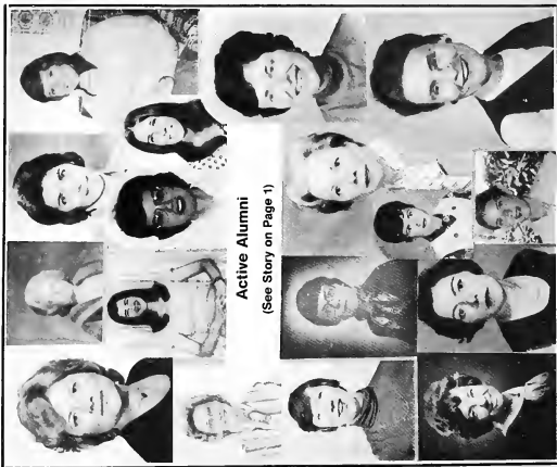
Active Alumni (See Story on Page 1)